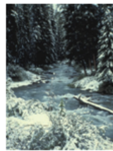
Northern Coniferous Forest or Taiga