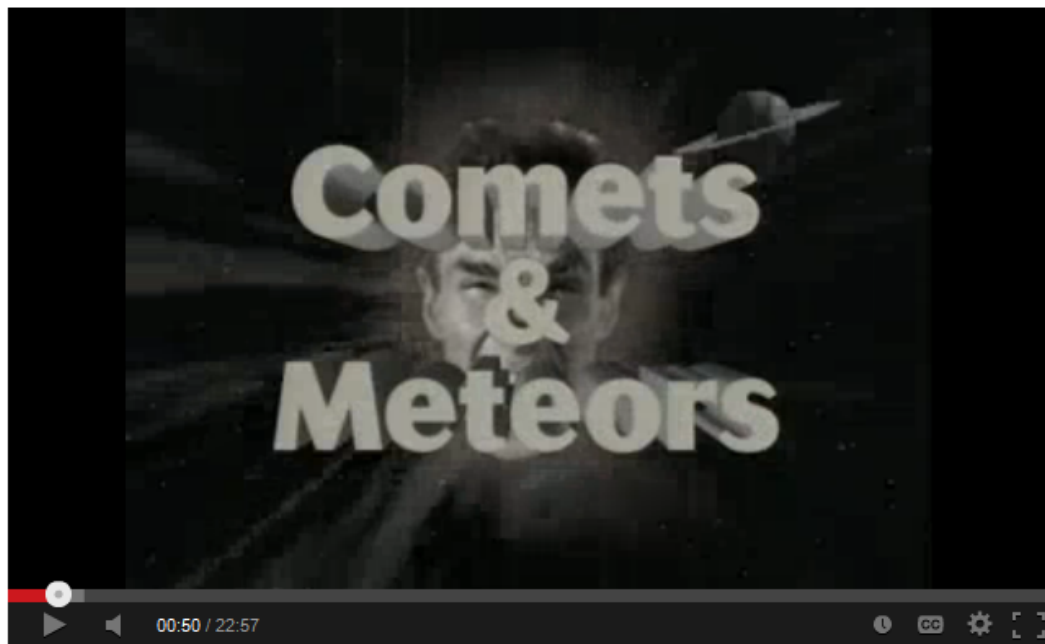
095 Comets and Meteors