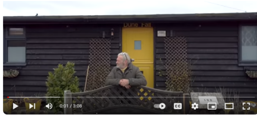
Norfolk's collapsing coastline: I won't give up my home that's falling into the sea | Times Reports