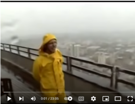
Bill Nye The Science Guy Season 2 Episode 19 Atmosphere

Bill Nye the Science Guy FULL EPISODESS Subscribe