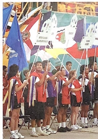
Opening Ceremonies, 2002 North American Indigenous Games, Winnipeg