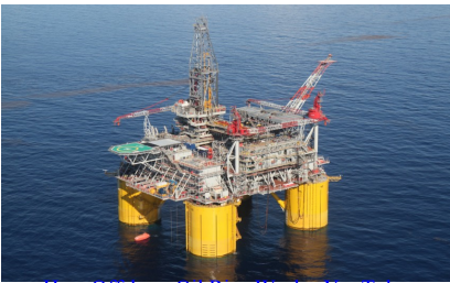
How Offshore Oil Rigs Work - YouTube