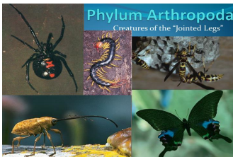
Phylum Arthropoda Creatures of the "Jointed Legs"