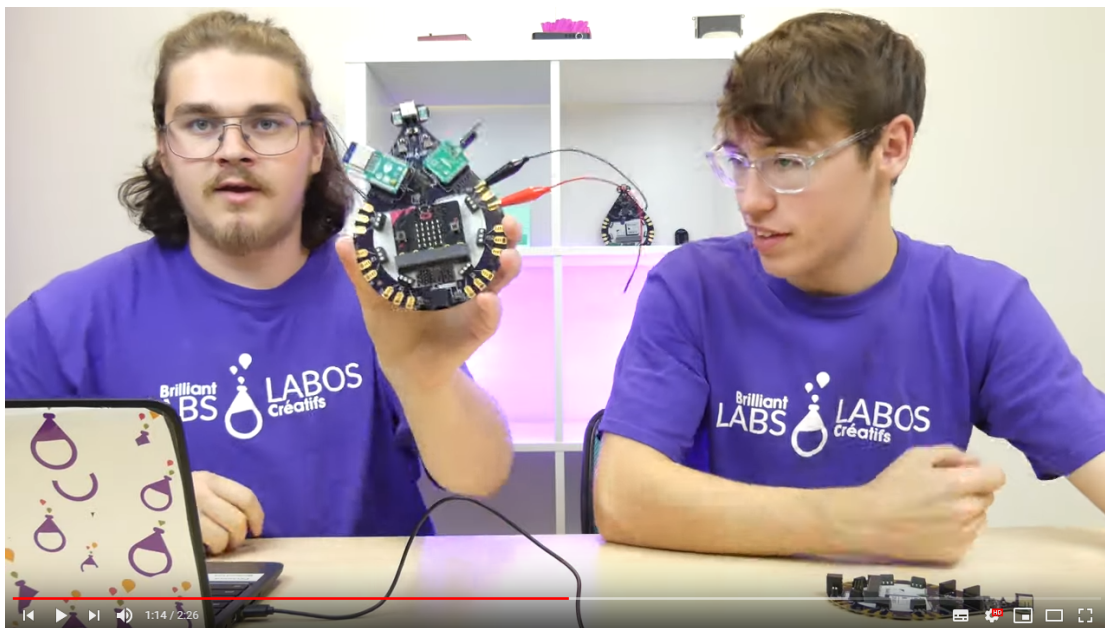
v To Hook Up Your b.Board! #microbitlive #microbitlive2019