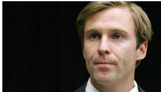
CP Video Dec. 18 2014, 1:39 PM EST

Those conditions include a process to consult with First Nations, a plan for waste water disposal and credible information about the impacts fracking has on health, water and the environment, Brian Gallant said Thursday.