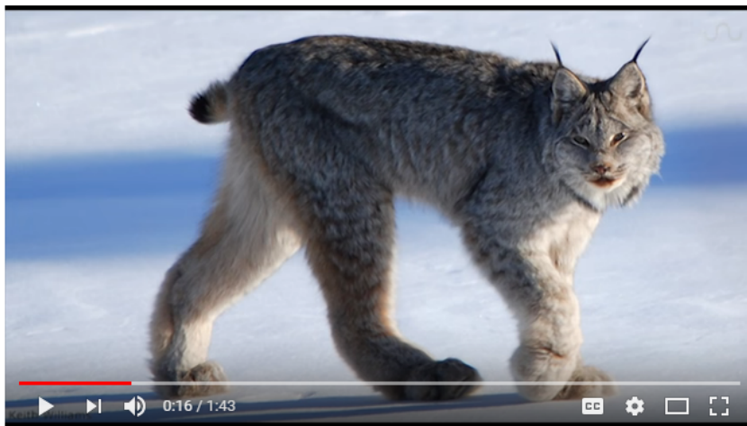
CANADIAN LYNX - Amazing Animal Species