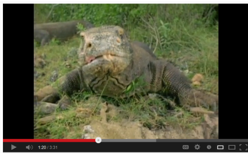
Nature's Perfect Predators - Komodo Dragon