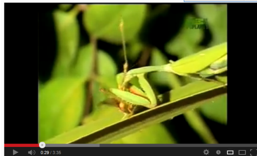
Nature's Perfect Predators- Praying Mantis