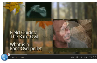
Field Guides: The Barn Owl What is a Barn Owl pellet