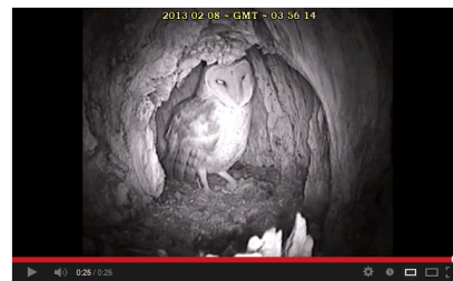
2013 02 08 - GMT -03:06:14 male barn owl regurgitates a pellet - Audubon Starr Ranch, Ca.