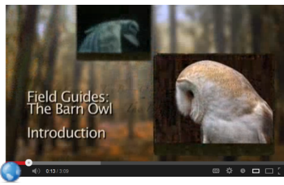
Field Guides: The Barn Owl Introduction