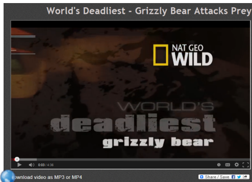
World's Deadliest - Grizzly Bear Attacks Prey