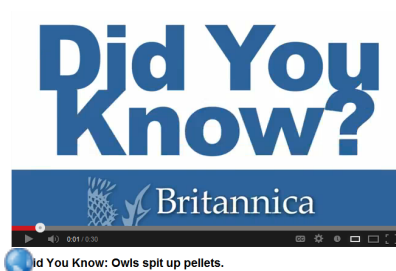
Did You Know: Owls spit up pellets.