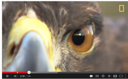
Golden Eagle vs. Jackrabbit