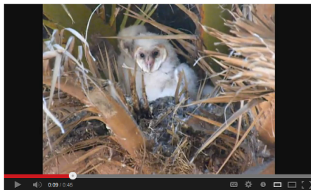
Baby owl ejects pellet