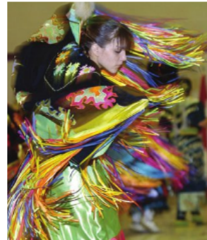
Woman Dancing an Aboriginal Fancy Dance