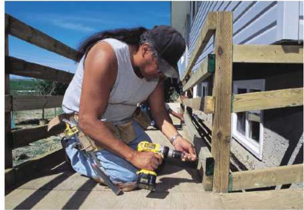
Installing ramps makes homes more accessible for people who use wheelchairs.