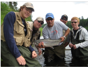
MVHS Fly Fishing Club