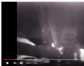
first Moon Landing 1969

On July 20, 1969, Neil Armstrong became the first human to step on the moon. He and Aldrin walked around for three hours. They did experiments. They picked up bits of moon dirt and rocks.