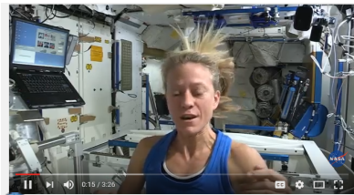
Running in Space!