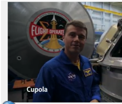
Everything About Living in Space