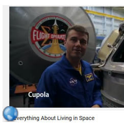
Everything About Living in Space