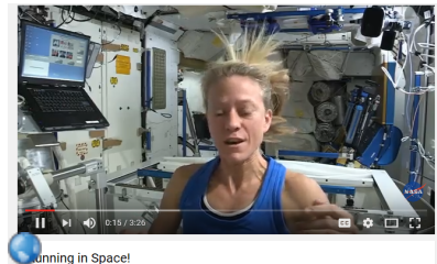
Running in Space!