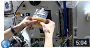
Life on Station