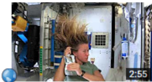
Karen Nyberg Shows How Yo Wash Hair in Space