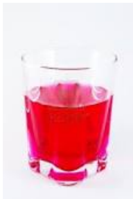
Water and food coloring