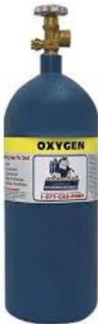
Oxygen that we breathe