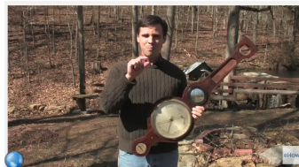
The history of the barometer (and how it works) - of Bar-Yosef